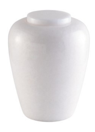
with "Simply Marble" Urn £275:00