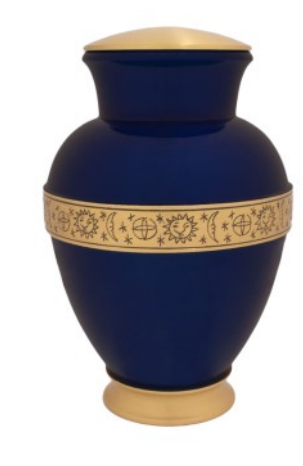
with Blue Harvest, Metal Urn