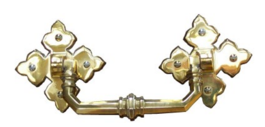
Set of Antique, Solid Brass Gothic Handles.£685:00