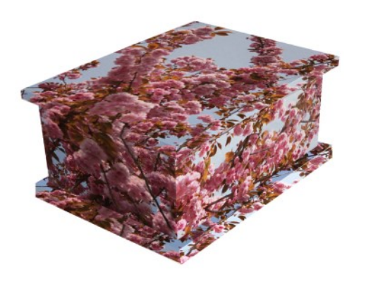
with Spring Blossom Casket £295:00