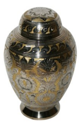
with Ambassador Urn £285:00