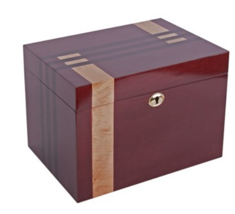
with Inlaid Wooden "Azure" Casket £255:00