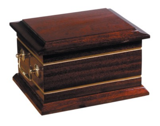
with Solid Wood "Lesbury" Urn £275:00

Our Prices Include for the Collection/Receiving of the Ashes, for taking responsibility for them and for storage on our premises for up to thirty days Subject to availability