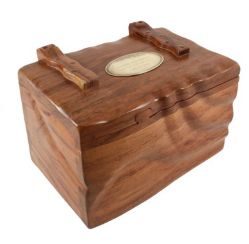
with Solid Wood "Trent" Urn £295:00