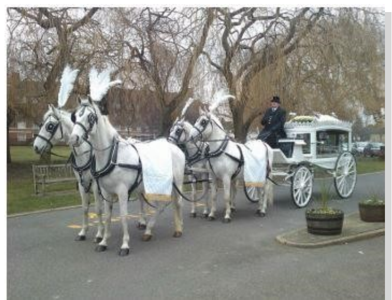
Horse-Drawn Hearse with 2 pairs of White Horses and a white Hearse. Additional charge from: £1990.00