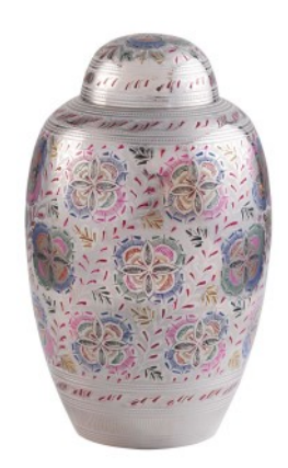
with "Grace" Urn £275:00