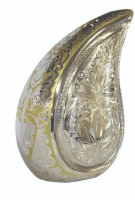
with Teardrop Patterned Urn £375:00 Inc. Keepsake - £455.00