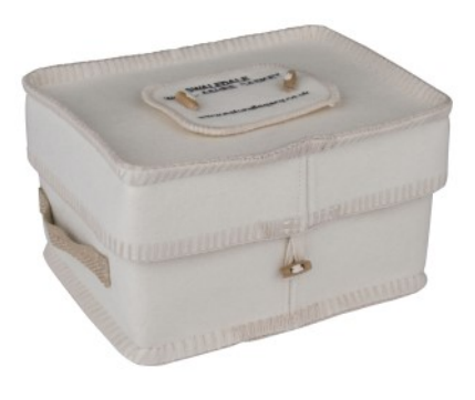
with White Woollen Urn £225:00