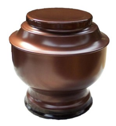
with Metal Spun Urn £175:00