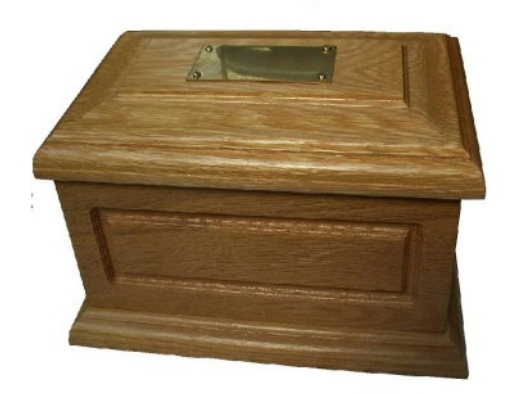
with Solid Oak Casket £215:00