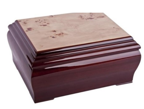
with Continental Casket £235:00