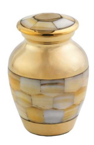
with Mosaic Urn £285:00