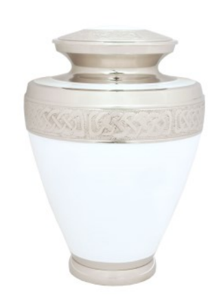
with Brass "Marble White" Urn £275:00