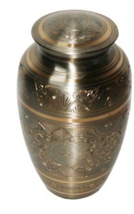
with "Sovereign" urn £270:00