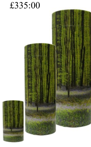
with Bluebell Scattering Tube All sizes 1 - £95:00 (2 - £125:00) (3 - £150:00)