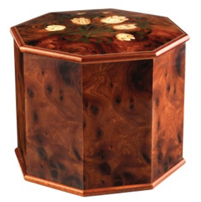
with Florence Urn £585:00