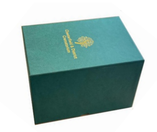
with Crematorium Box £45