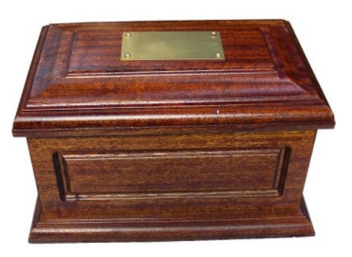
with Solid Mahogany Casket £215:00